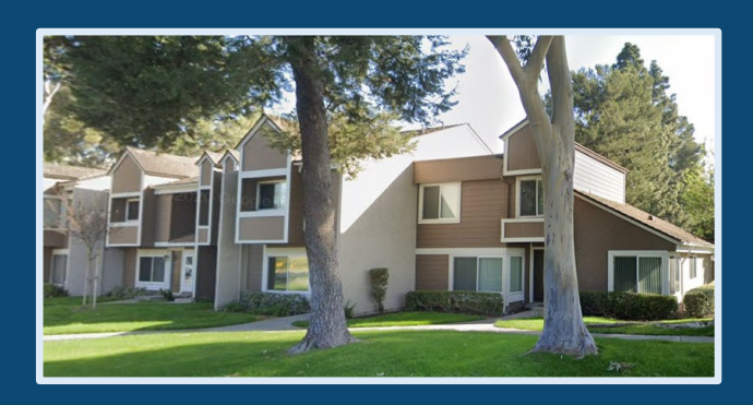
Density: 7.8 units/acre Stories: 2 Type: Attached Townhomes Cerritos Neighborhood: Sundance