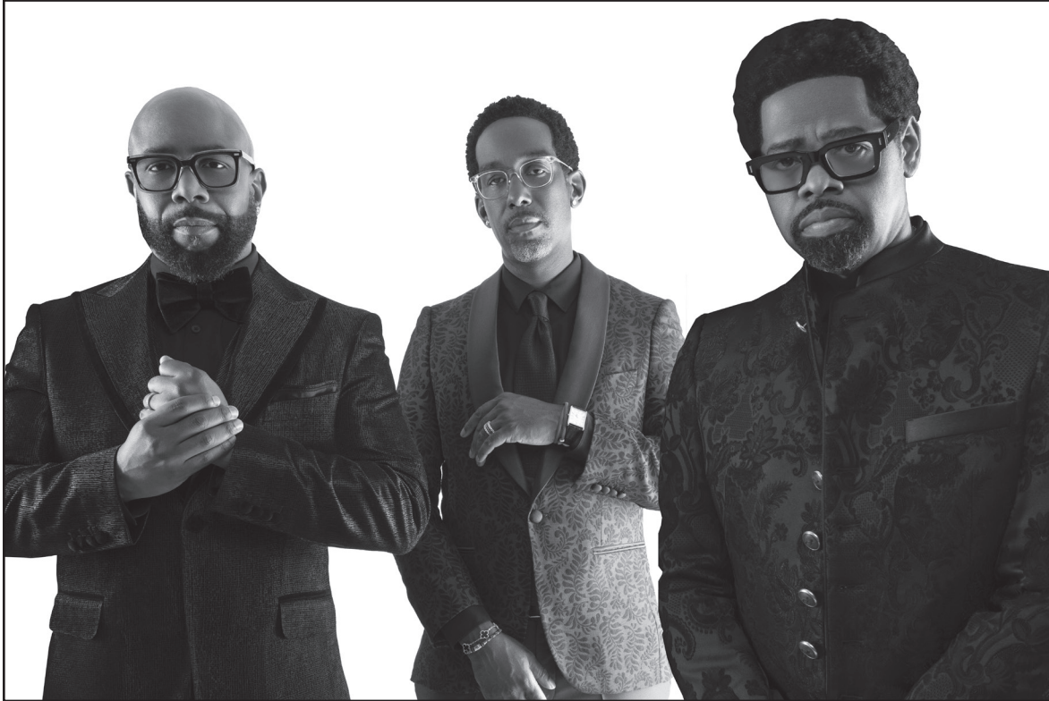
Boyz II Men performs at the Cerritos Center for the Performing Arts on Saturday, August 23.

It's "One Sweet Day" at the Cerritos Center for the Performing Arts, and the excitement is downright palpable ahead of the 2025-2026 Season! Who better to get the party started than the legendary four-time Grammy-winning R&B group Boyz II Men? Crowned by "Billboard" magazine as one of the biggest boy bands, the iconic ensemble is sure to have you buckling with delight and "On Bended Knee" as it delivers a rockin' night of timeless hits – think "End of the Road," "I'll Make Love to You," and "Motownphilly" – at 8 p.m. on Saturday, August 23.