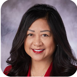
Lynda Provide Johnson Mayor

Elected: April 12, 2022 Term: April 27, 2022 - April 14, 2027