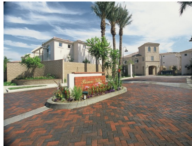
Pioneer Villas Opened in 2001