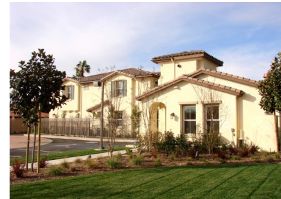
Fountain Walk Opened in 2007