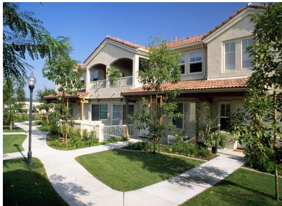
Emerald Villas Opened in 2000