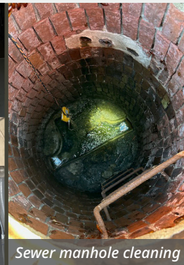
Sewer manhole cleaning