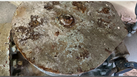
Corroded water shutoff valve