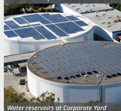
Water reservoirs at Corporate Yard