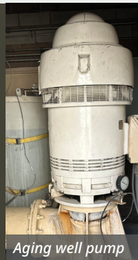
Aging well pump

Ensuring clean, safe, and reliable drinking water is critically dependent on regular maintenance and system upgrades. Revenue sources have not kept pace with these investment needs.