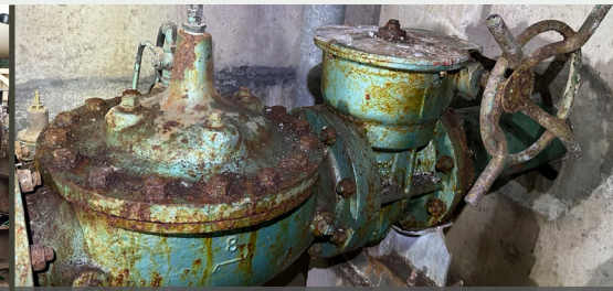
Corroded pressure relief valve

Your support helps the City of Cerritos address our aging, deteriorating, and failing water and sewer infrastructure. Learn about our services, infrastructure needs, and funding sources.