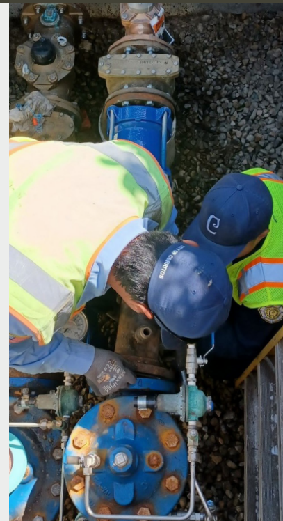
Water valve replacement