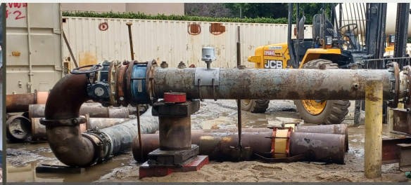
Water pump testing at well