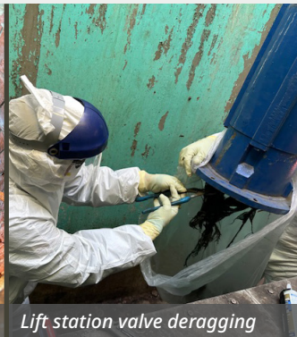
Lift station valve deragging